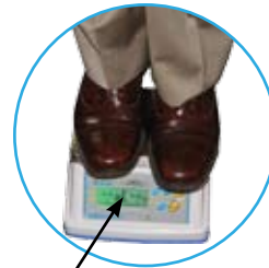
Advanced overload protection