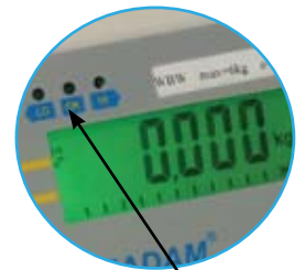
Coloured LED indicators